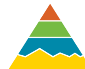
Pyramid Model Practitioners

Since 2020, we have worked diligently to ensure a smooth transition from the Pyramid Plus Center at the University of Colorado Denver to the Pyramid Network Hub at HCCC. During the first 18 months, we worked closely with a cross-sector Transition Team and provided numerous opportunities to collect input and feedback from Pyramid practitioners at all levels. This information was crucial as we co-created the Pyramid Network Hub's purpose, guiding principles, desired outcomes, leadership structure, core functions, and action plan. We remain committed to facilitating the Pyramid Network Hub as Colorado's early childhood system evolves into the future.