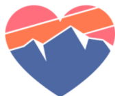
Early Childhood Mental Health Consultants